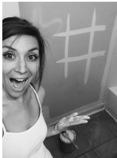
Making changes to my own house #homeimprovement #diy #hashie #hashtag

I scheduled the showing for that day and brought the girls by on my way to Gaithersburg. After the showing, my client put in an offer and the property was under contract in a matter of days. He got the property he wanted, and I got to pull it all off - with the help of our village of course.