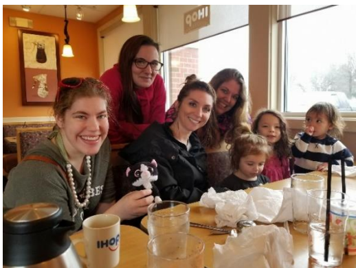
Breakfast with my people #girlsquad #breakfastclub #mypeople

One person with a "can do" attitude is just not going to cut it. ( Trust me, I've learned that the hard way. ) From getting my girls to school everyday to closing contract after contract every month, I wouldn't get anywhere if I relied on my own strength alone.